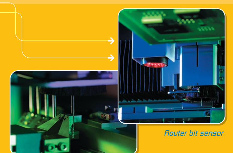
Auto tool change